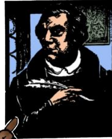
MARTIN LUTHER 1483-1546

M ARTIN LUTHER ONCE SAID: "THE BIBLE IS A GREAT AND POWERFULL TREE. EACH WORD IS A MIGHTY BRANCH. EACH OF THESE BRANCHES I HAVE SHAKEN WELL, AND THE SHAKING OF THEM HAS NEVER DISAPPOINTED ME."